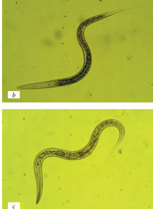
Fig. 2. Post-embryonic development of Oeso-phagostomum dentatum in vitro: a - L1 (×400); b - L2; c - development of intestine cells in L2 (×100).

the development and hatching of L1. On the third to seventh days, intense formation of L2 (12–67 %) was detected. At that time, 27 % of larvae died, 5 % of eggs stopped developing. On the eighth to tenth day, L2 formation was observed (50–63 %); 5 % of embryonic and 32 % of post-embryonic O. dentatum died simultaneously.