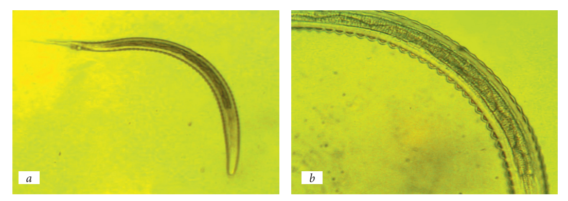
Fig. 3. Formation of Oesophagostomum dentatum L3 in vitro: a (×100); b (×400).